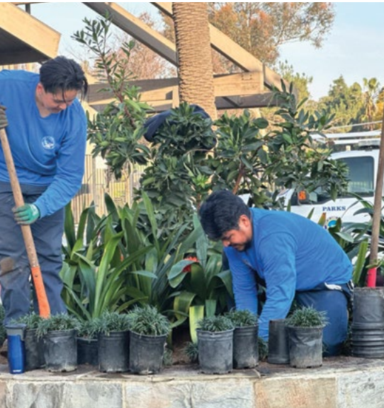
TWO BEAUTIFICATION PROJECTS WERE COMPLETED AT CHAVEZ PARK AND WHALEY PARK.