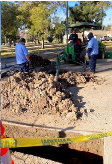
CREWS WORK TO REPAIR A WATER LINE BREAK AT THE RECREATION DOG PARK