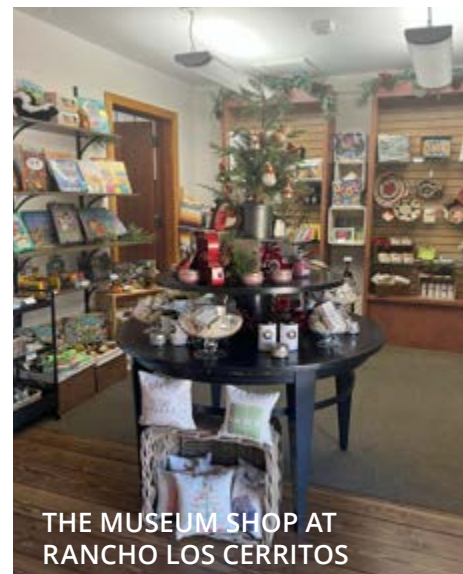
THE MUSEUM SHOP AT RANCHO LOS CERRITOS

So, skip the mall and enjoy a visit to the park instead where you can relax, have fun and find great gifts for the holidays.