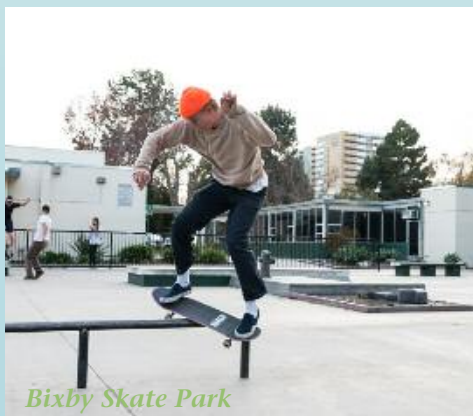
Bixby Skate Park

Voters selected Bixby Skate Park as the best. LBPost wrote that Bixby was originally a DIY park created by local skaters within Bixby Park. The skate park was officially recognized