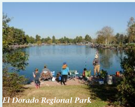
El Dorado Regional Park

Long Beach Parks, Recreation and Marine was a big winner in the Long Beach Post's 2019 "Best of Long Beach" poll, that engaged readers in nominating and voting for their favorite places, people and services.