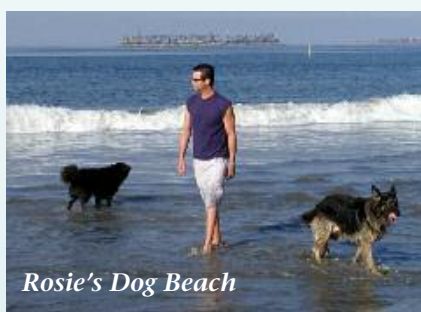
Rosie's Dog Beach

by the City in 2015 when it was revamped by California Skateparks. It's remained a beloved free skate park with a robust community of skaters since.