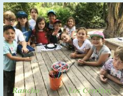
Rancho Los Cerritos

was a three-time honoree, being recognized for their summer camps where kids can pan for gold, make adobe bricks and have fun in the historic grounds. The Rancho's gardens and backyard were noted as a perfect spot for a wedding and their architecture was mentioned as key to learning about the history of Long Beach.