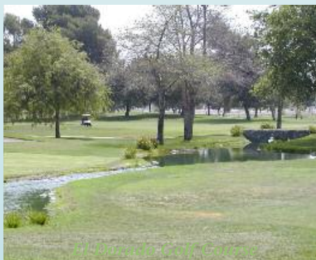
El Dorado Park Golf Course

was awarded the title of Best Golf Course. Voters said that El Dorado "does an exceptional job of handling a heavy, daily load of golfers in an efficient manner while maintaining its grounds and greens in exceptional condition."