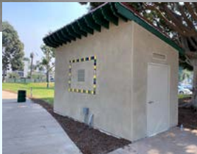
Bixby Parcel One includes a free-standing restroom, new irrigation system and landscaping.