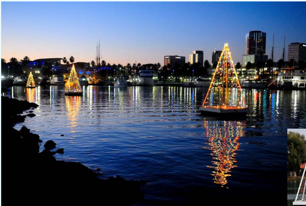
Unique to Long Beach during the holiday season, Trees in the Bay are lit from Thanksgiving weekend through the end of the year.