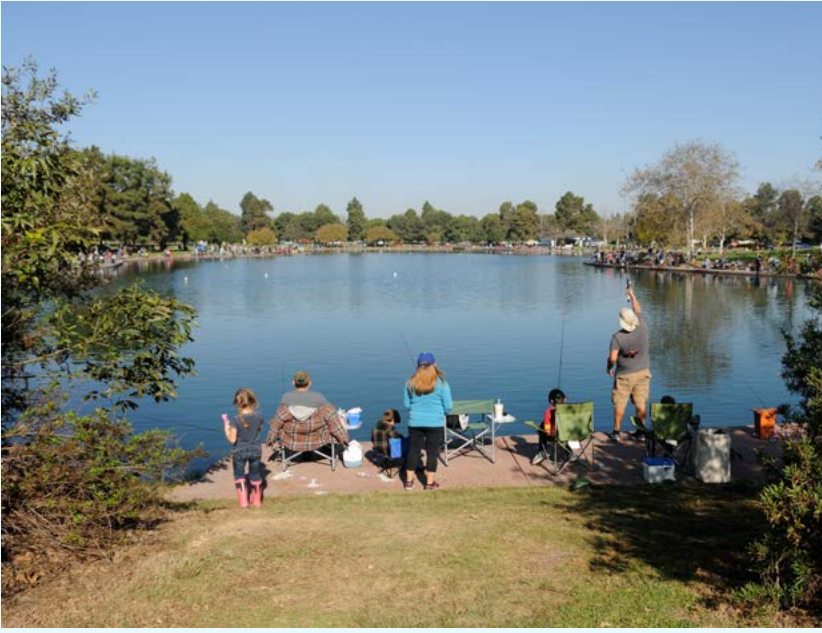
A Parks, Recreation and Marine gift certificate parking pass is the perfect gift for anyone who is a nature lover on your holiday list.

An annual parking pass to El Dorado Regional Park is a great idea for the fisher, dog lover, archer, model boat or plane enthusiast, or nature lover on your gift list this holiday season.