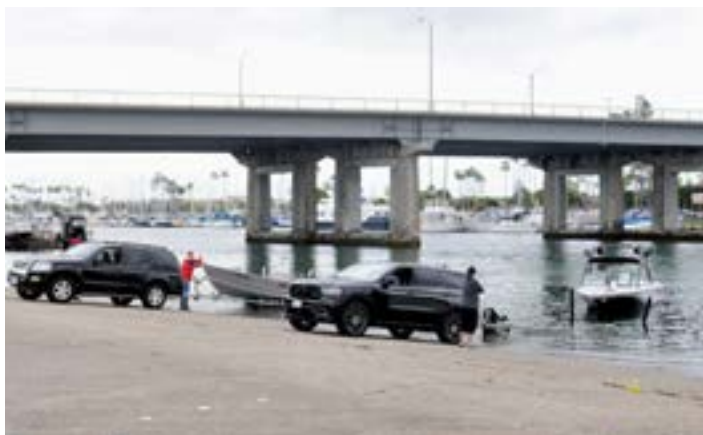
Davies Launch Ramp, shown here will receive an improvement grant of $300,000. So as not to risk grant funding opportunities, the private use practice of "First Right of Refusal" will not be reinstated.