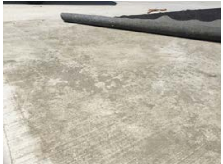
Mats can damage the new docks as seen in this photo.

No Permittee shall install or attach any materials to the docks, fingers or gangways, including but not limited to: fender material, dock wheels, or carpet. Costs associated with the removal of any such attached items and restoring the dock to its condition prior to the installation will be assignable to the Permittee.