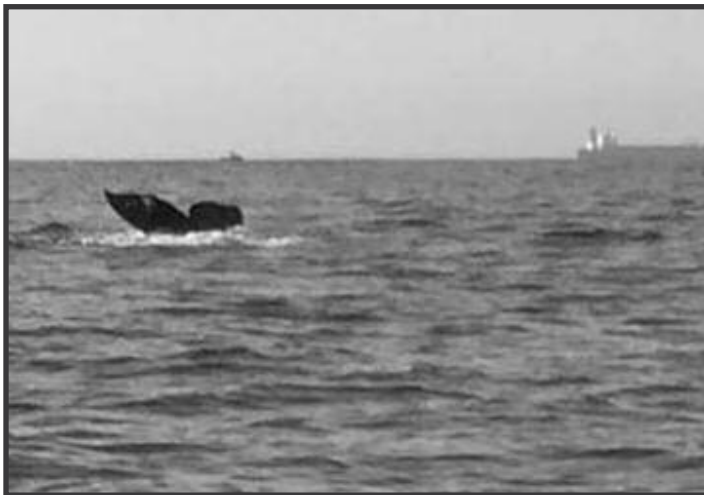
Whale tale? A California Grey Whale tail captured by yours truly. Whale migration covers 12,500 miles of coastline.

of the restrooms at the Shoreline Marina, specifically D3 through D7. In recent months those of you who use these have unfortunately been subjected to restroom conditions you'd expect at a public camping ground during the heavy summer months. I apologize and assure you that we are re-evaluating our staffing. We are in the process of detailing each of these restrooms. Let me urge you to contact the marina office when a restroom is in need of cleaning. Please do not hesitate to call.