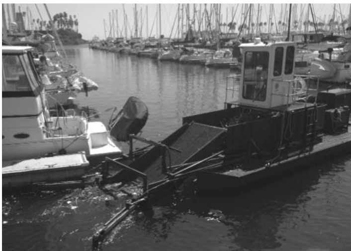
The Marine Bureau's "Marauder" trash collection boat.

With more El Nino rains likely in the near future staff will be even more prepared after these recent experiences.