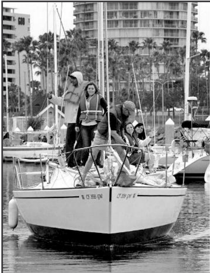
Set a student's life on a whole new course with the adopt-a-student program.