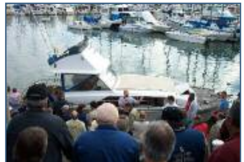
Hopeful future boat owners bid on a large range of vessels and marine related items on Saturday, Jan. 11 at Alamitos Bay.

Once an auction date is set an email notification will be sent to all subscribers with details.