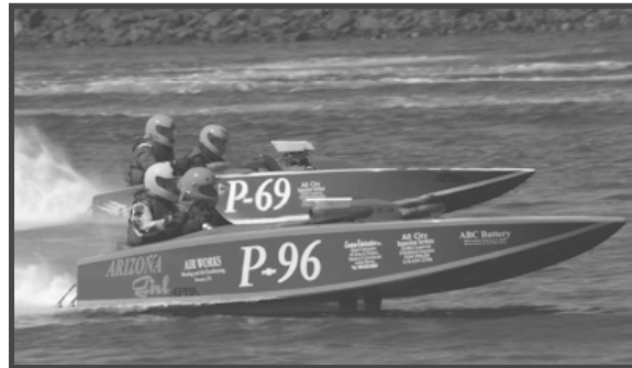
Marine Stadium Powerboat Racing Classic