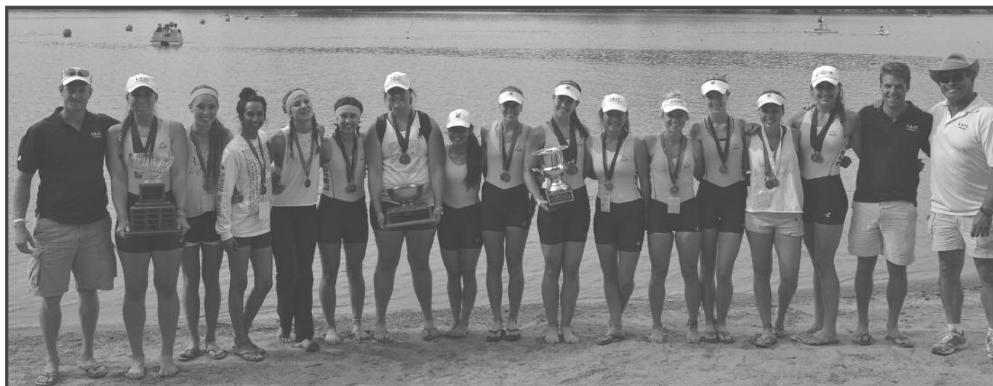
Long Beach Junior Crew Wins Regionals