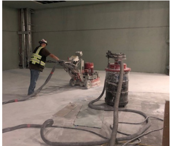
Terrazzo installation in the new Baggage Claim area