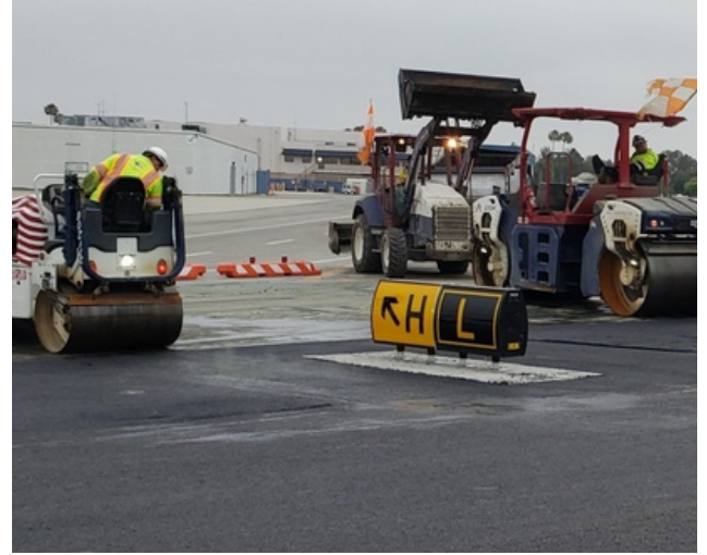
Grading and paving in the Phase V area near Taxiway H