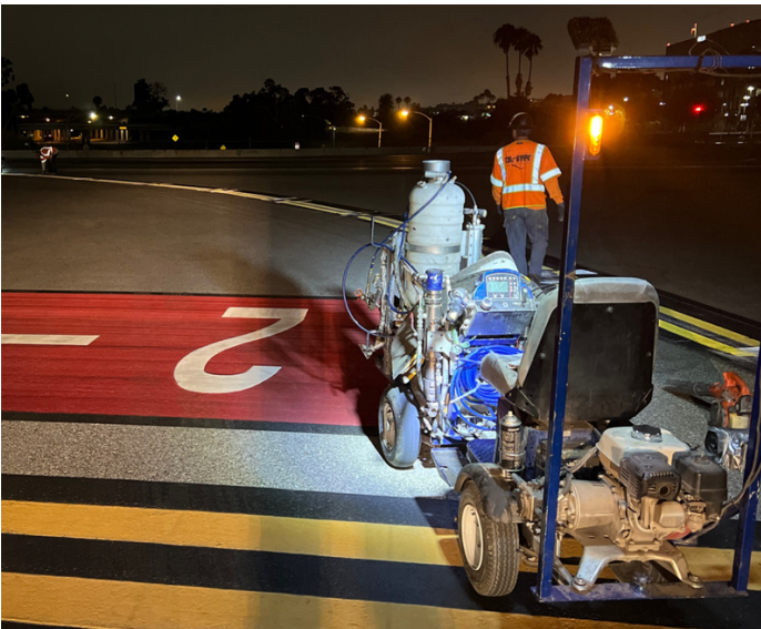
Striping in Phase I area

Reconstruction of Taxiway L continues to move forward. Last month, striping was completed in the Phase I work area near the Lakewood Tunnel and the Phase II area near Taxiway L1 and L2. Asphalt pavement was placed in the Phase I area, near the Lakewood Tunnel, and the Phase V area, near Taxiway H. Phase I, II and a portion of V were opened for aircraft use in August. Work was initiated in the Phase III area, adjacent to the UPS ramp, where existing asphalt and base were removed, and soil cement was placed at the Spring Street tunnel.