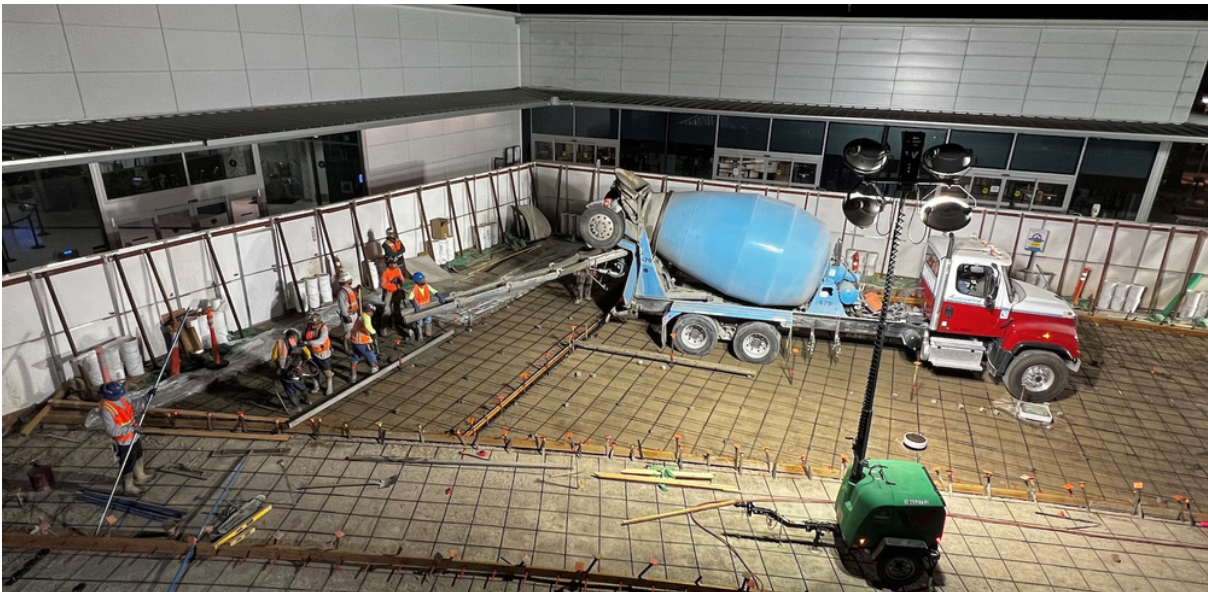
Preparing for the cement pour in the Plaza area