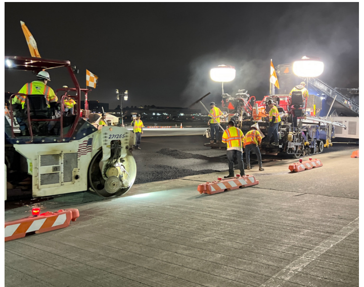
Asphalt placement near the Lakewood Tunnel