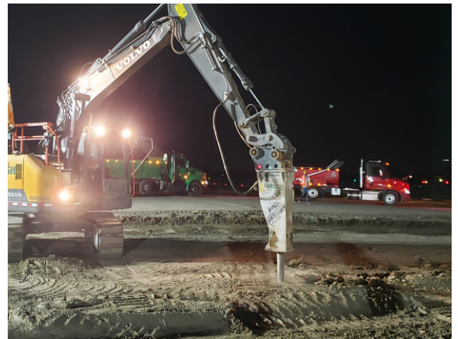
Work is underway in the Phase III area