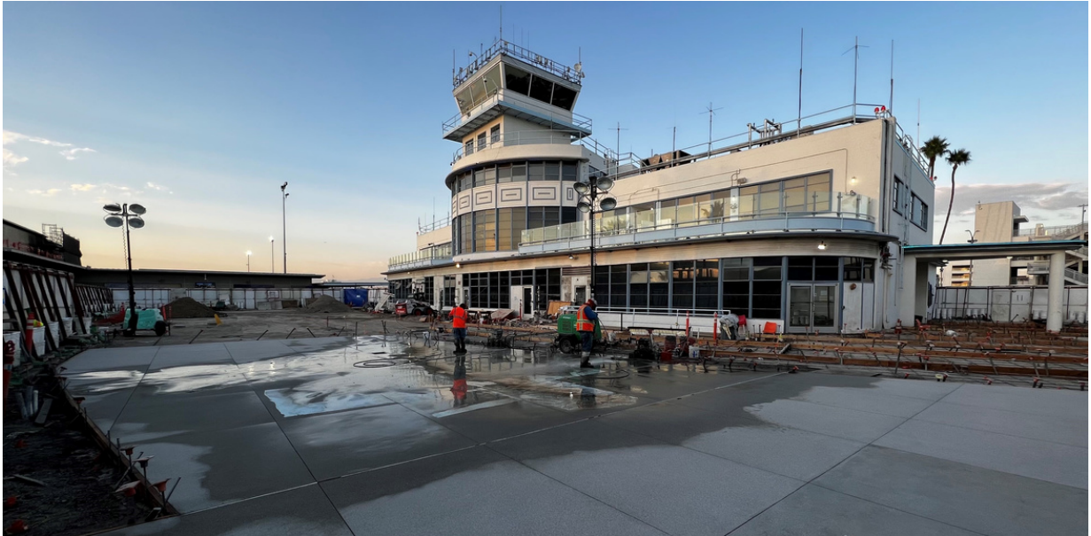
A peek of the Plaza area where the old CBIS facility once stood