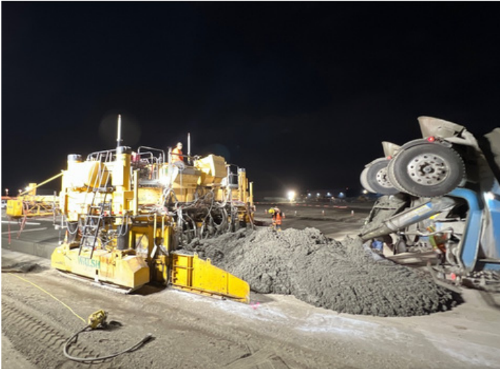
Portland Concrete Cement (PCC) placement