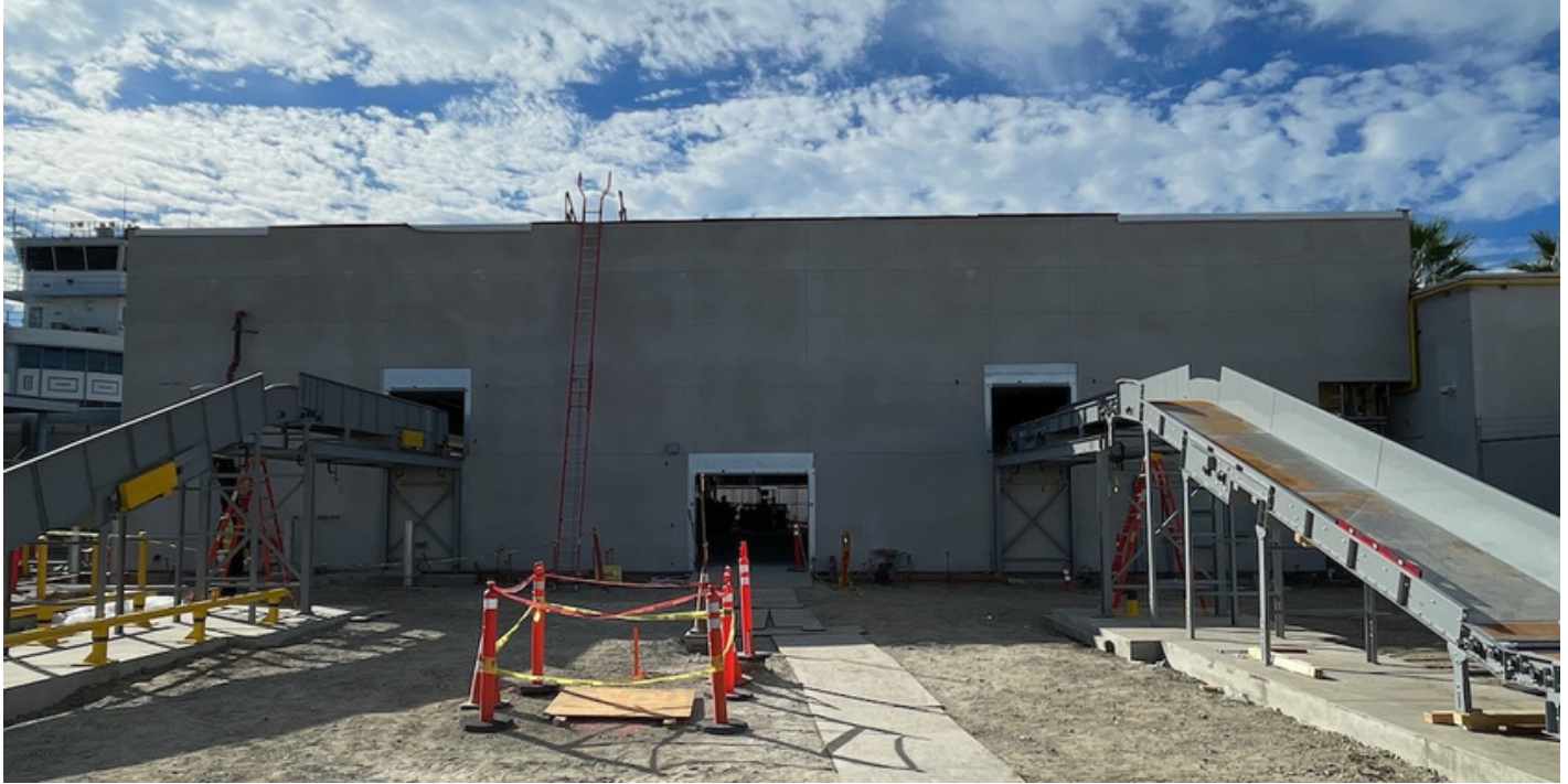
Baggage conveyor installation is underway