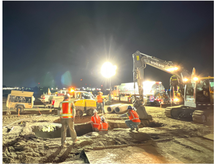
Installation of the new storm drain line