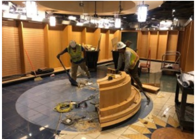
Preparation for the Historic Terminal renovation continues