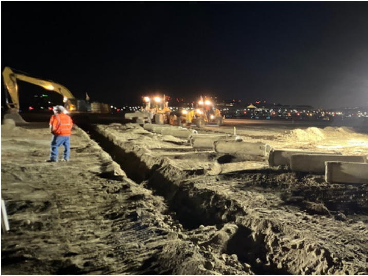
Excavation &amp; removal of existing storm drain line