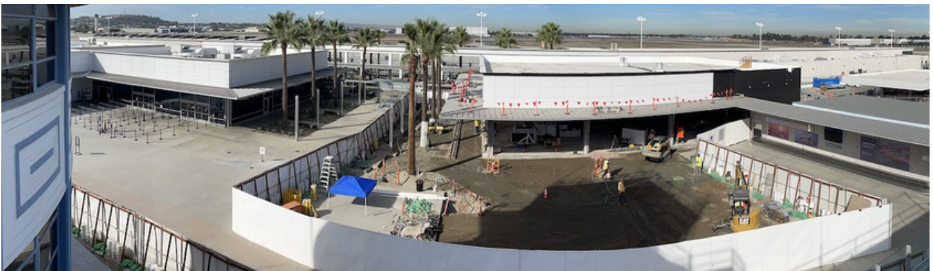
Panoramic view of the Plaza and New Baggage Claim areas

Construction of the new Baggage Claim area and the plaza continues to progress behind the construction walls. Check out the panoramic view below! Grading and concrete placement remain ongoing in the plaza. Installation of two conveyors for the inbound new Baggage Claim systems is underway. And in the Historic Terminal, work related to floor protection and the mosaic tiles continues, as well as the removal of cabinetry in the vacated gift shop. Public access to the restrooms and 2nd floor administrative offices will remain in place through November.