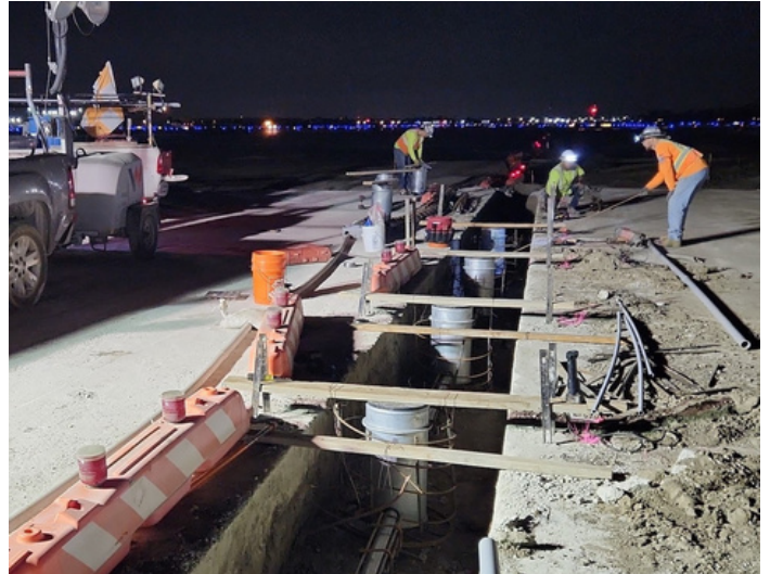
Electrical installation for edge lights