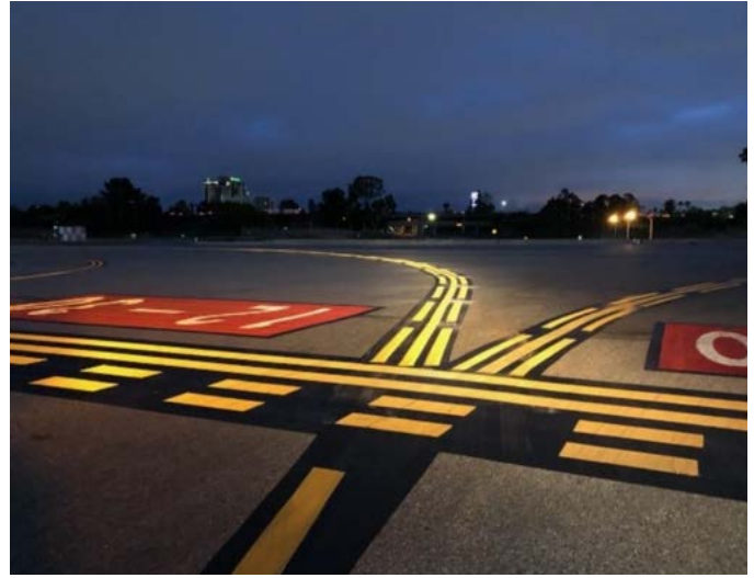
Striping is complete at Runway 12-30 and Taxiway L1 and L2