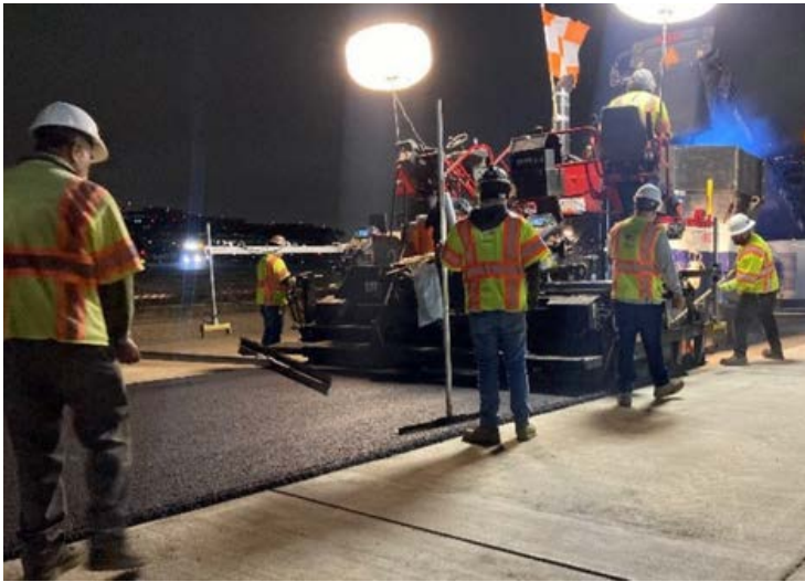
Paving in the Phase II area

A significant amount of work was completed in the Phase II area of our Taxiway L project, including the cement treated subgrade placement, subbase and asphalt paving, trenching and installing edge lights, as well as striping and the reconfiguration of the Runway 12-30 centerline lights. With the completion of the Phase II area, Runway 12-30 is now back to full length. In the Phase I area, subgrade and subbase work continued last month and asphalt paving was initiated. Electrical work in the Phase V area, which is adjacent to the former Gulfstream space, remains ongoing. The reconstruction of Taxiway L with concrete pavement will provide an anticipated service life of 40 years.