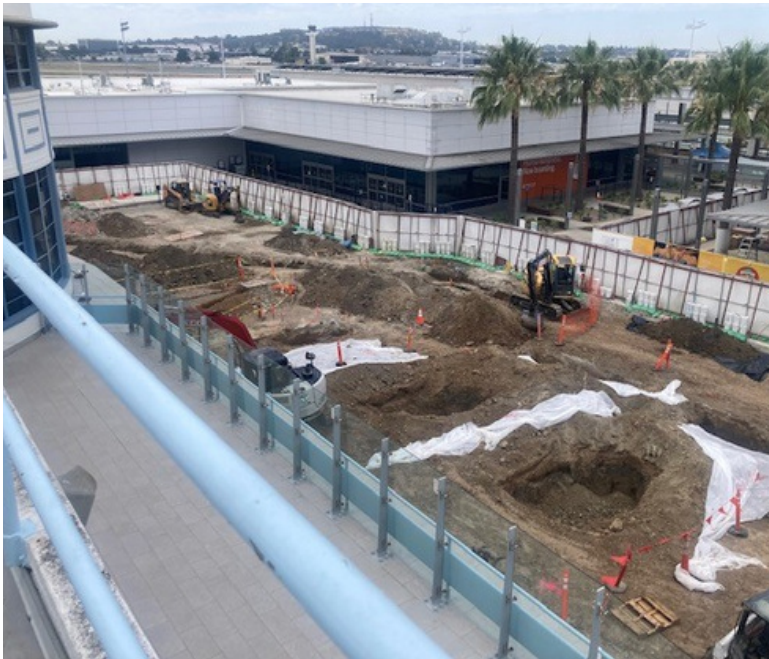
Soil removal in the Plaza area remains ongoing

The new Ticketing and Checked Baggage Inspection System (CBIS) facilities are entering their third month of usage. Demolition of the old CBIS facility has been completed and soil removal remains ongoing. Underground electrical duct bank installation in the Plaza area is moving forward. The electrical high voltage conduits will serve the new Baggage Claim facility and other buildings. The concrete slab-on-grade and retaining wall for the west side of the Baggage Claim facility have been placed, and roofing, fireproofing and fire sprinkler installation are in progress. The brand-new Baggage Claim facility is scheduled to open in late 2022.