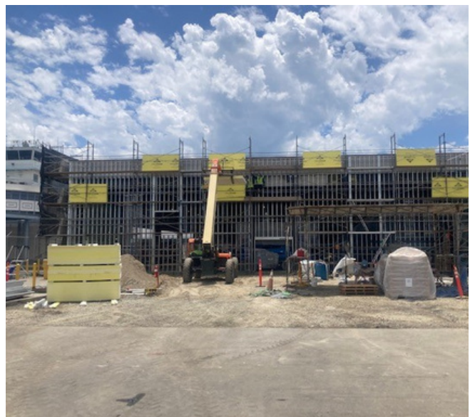
View of the Baggage Claim facility's north exterior wall