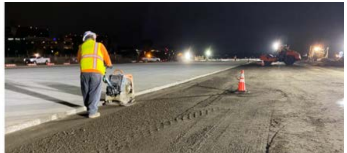
Grading and compaction in the Phase I area