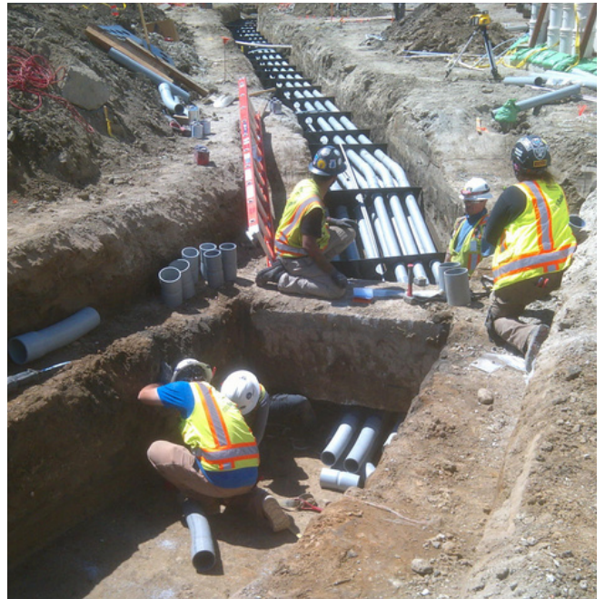
Underground electrical duct bank installation