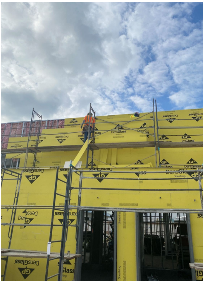
Exterior sheathing installation

Construction of the new concessions space and baggage service offices continues to progress. The exterior sheathing for the building is near completion. After sheathing is installed, plaster will be applied to the exterior walls. And inside the space, interior doors and frames installation, overhead mechanical work and fireproofing are underway. Meanwhile, structural enhancement of the Historic Terminal remains ongoing. In September, steel installation, overhead electrical work, cable removal and demolition of the first floor shear wall continued. Adjacent to the Ticketing Lobby, installation of the new skycap station is finished. Once staff are trained, it will be open for business!