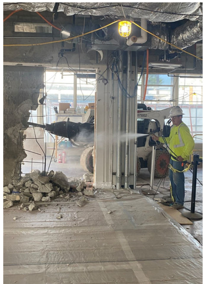
Demolition work in the Historic Terminal