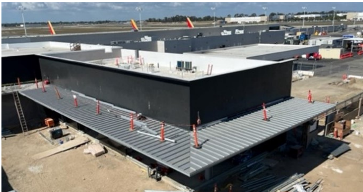
Installation of the metal roof was completed