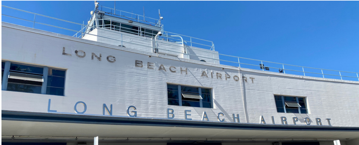
New signage relocation brings the Historic Terminal façade closer to how it looked in the past