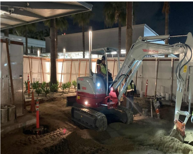
Grading work for a new shade canopy

Work continues in the Historic Terminal, including the placement of Fiber Reinforced Polymer (FRP) on the first floor and shotcrete (sprayed concrete projected at high velocity to reinforce steel rods) in the basement and first two floors, as well as demolition work on the fifth floor. Adjacent to the terminal, excavating and underground electrical work is underway for the new baggage service offices and a new concession space.