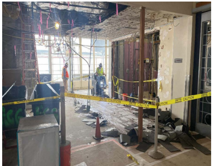
Flooring removal in the Historic Terminal