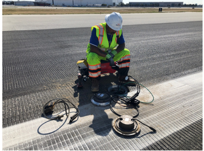
Placing new LED centerline lights