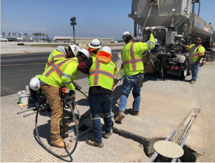
Encasing new touchdown zone base cans