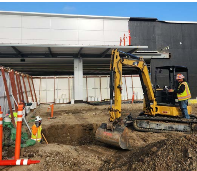
Excavating and underground electrical work for the new BSO and concession is underway