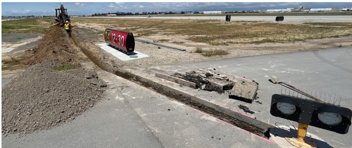
Conduit installation for runway guard lights