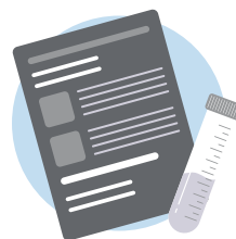
You want an STI Test