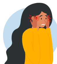
Infections of the nervous system including meningitis