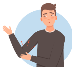
Joint pain, redness or swelling