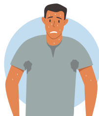
You have DGI symptoms