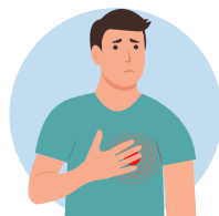
Infections of the blood or heart valves