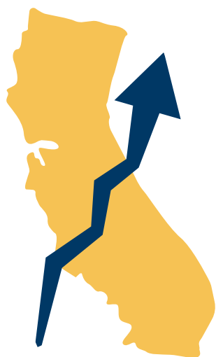
DGI is on the rise in California

The only way to prevent DGI is to get tested and treated for gonorrhea!