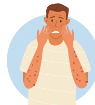
A rash that may become filled with clear fluid or pus