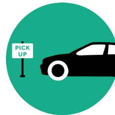
Vehicle Loading Zone Signage