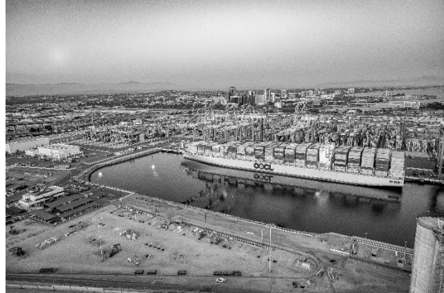
The Port of Long Beach Middle Harbor Terminal

Currently, the largest employer within the City is the Long Beach Unified School District, which operates 85 regular, one continuation, and two charter schools. The District's workforce ensures the success of students by maintaining high standards, a commitment to excellence and an offering a comprehensive scholastic program.