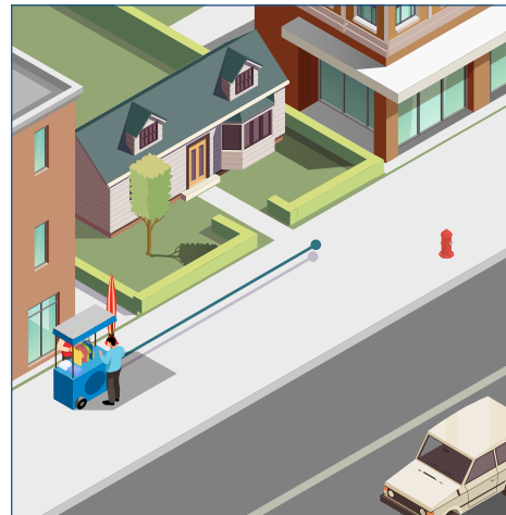
Single family home in mixed use zones | 20 ft Vendors may not operate within 20 feet of a detached or freestanding home in a mixed-use zone