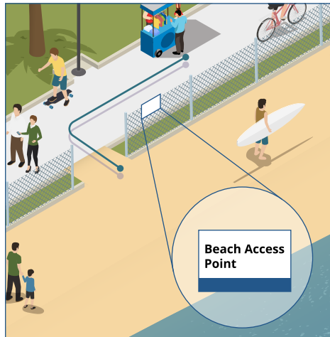
Beach Access Point | 25 ft Sidewalk vendors are not permitted to operate within twenty-five (25) feet of a beach access point. 5.73.120.B.16