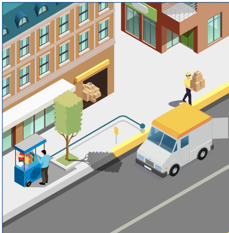
Loading Zone | 15 ft Sidewalk vendors shall not vend within 15 feet of a loading zone.