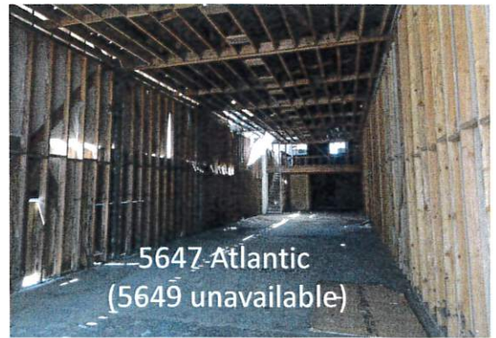
5647-Atlantic (5649 unavailable)