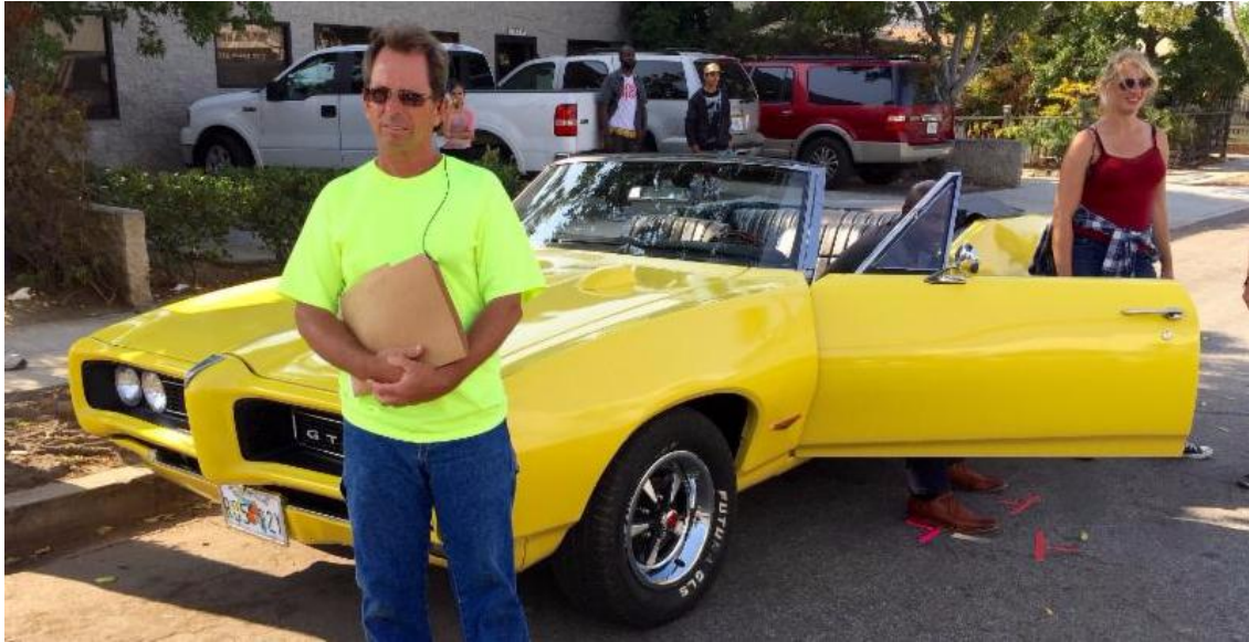
"Rosewood" filming in CD4 on Gladys Avenue in August 2015