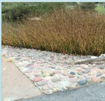
Before: Overgrown bulrush at El Dorado East Regional Park Lake

Grounds Maintenance handled downed trees at Houghton, Los Cerritos, Pan American, Whaley, El Dorado Regional Park and El Dorado West. In preparation for the storm season, staff worked to improve habitat and storm water flow in park streams and lakes.