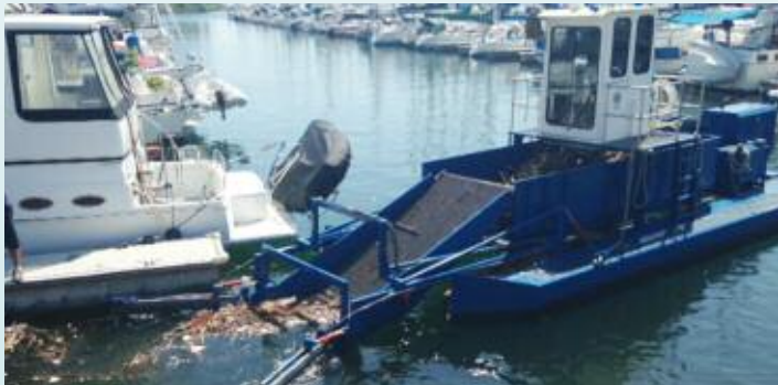
The Marauder pulls trash out of the harbor and marinas.

The first 2016 El Niño storm of 2016 on January 5 and 6 dropped about two inches of rain in Long Beach, and Parks, Recreation and Marine staff were ready to face the challenges that came with it.