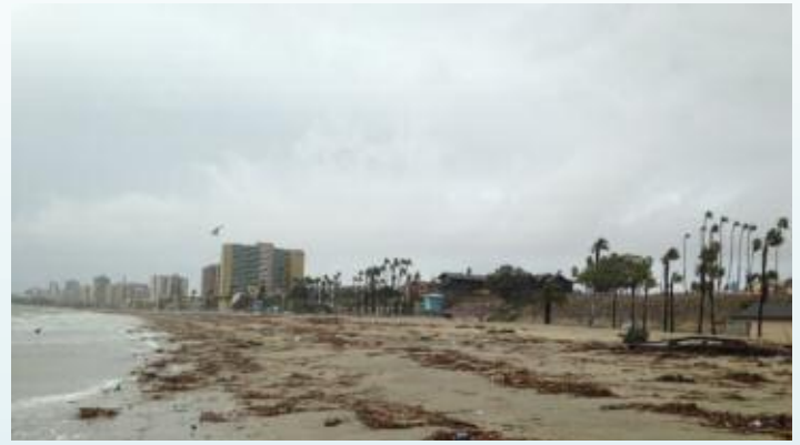
Crews had work cut out for them on the beach.

Marine Maintenance staff identified leaking roofs at two Alamitos Bay boat owner restrooms and in Basin Seven. Facility Maintenance staff repaired leaky roofs at the Maintenance crew facility, Department Administration and the El Dorado Nature Center men's restroom. Staff are also addressing a fallen fence at Coolidge Park