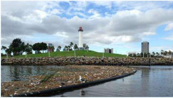
Trash boom shows its effectiveness in holding debris.