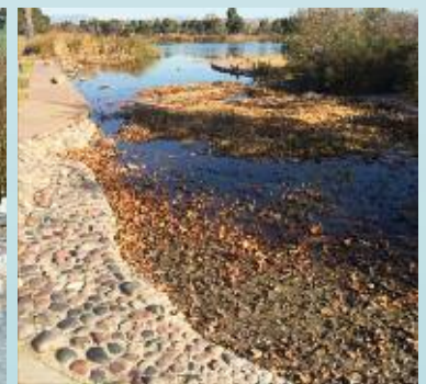
After: Cleared area will improve water flow.

Staff temporarily closed the El Dorado Nature Center trails during the storms for safety reasons including slip-py mud, flooding, and downed branches.