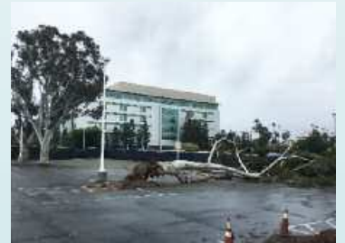
Fallen trees at Shoreline Aquatic Park and Catalina Landing