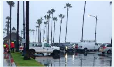
Flooding at Wardlow Park Community Center entrance and beach parking lot