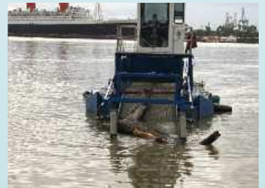
Debris Boom & Trash Skimmer Work To Minimize Debris Impacts