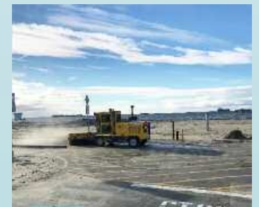
Beach Crews Fortify Sand Berms to Prevent Residential Flooding